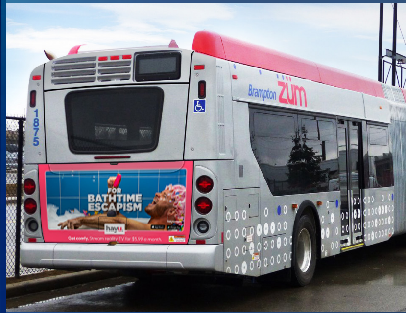
ZÜM HALF TAIL