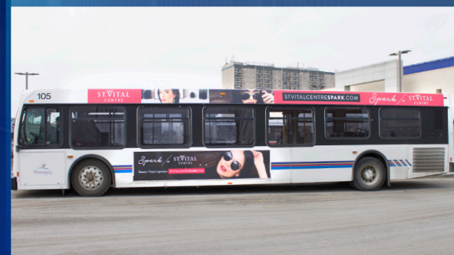
KING + HEADLINER