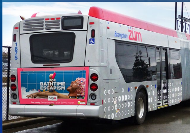
ZÜM HALF TAIL