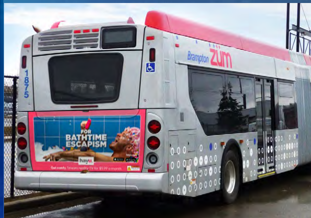
ZÜM HALF TAIL