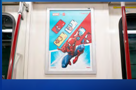
SUBWAY INTERIOR 28 CARDS