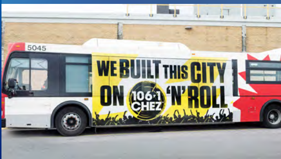
STANDARD BUS MURAL