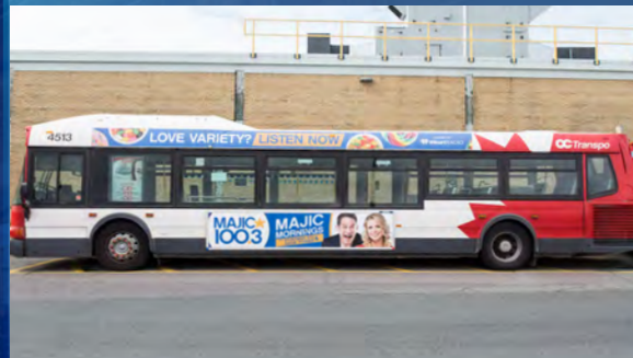
KING + HEADLINER