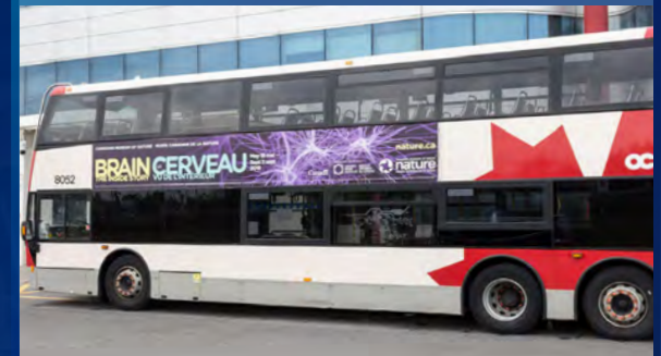
DOUBLE DECKER KONG