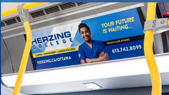
STANDARD INTERIOR CARD